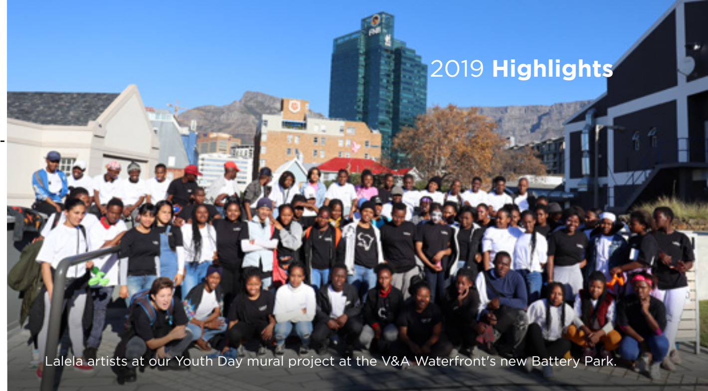
Lalela artists at our Youth Day mural project at the V&A Waterfront’s new Battery Park.