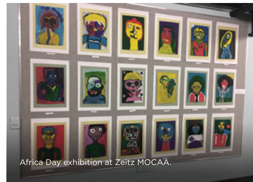
Africa Day exhibition at Zeitz MOCAA.