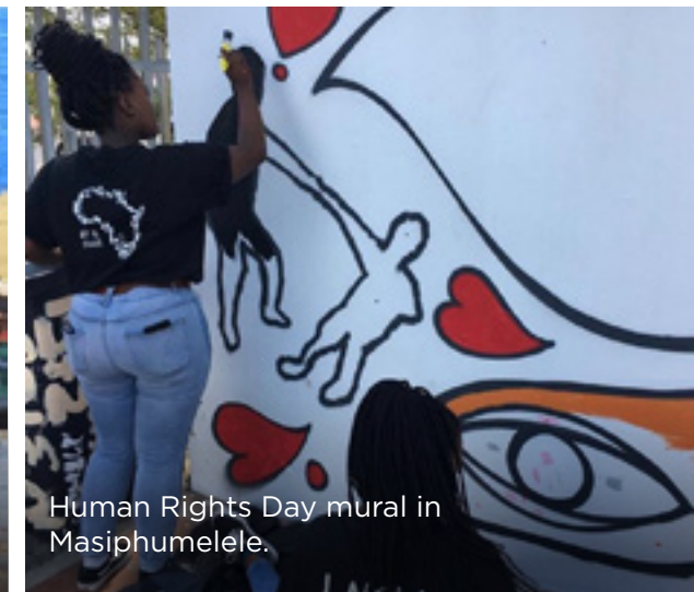
Human Rights Day mural in Masiphumelele.