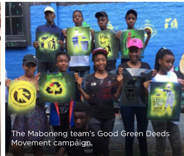
The Maboneng team's Good Green Deeds Movement campaign.