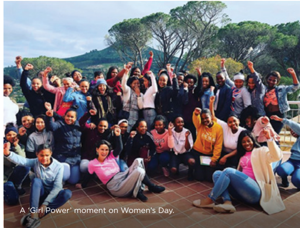
A 'Girl Power' moment on Women's Day.