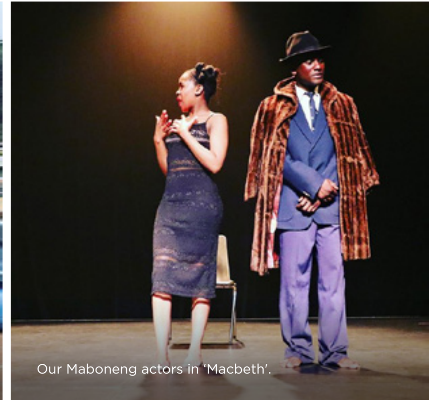
Our Maboneng actors in 'Macbeth'.