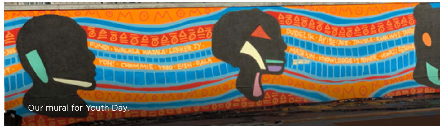
Our mural for Youth Day.