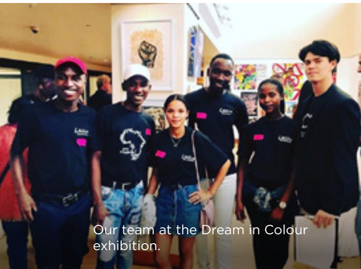
Our team at the Dream in Colour exhibition.