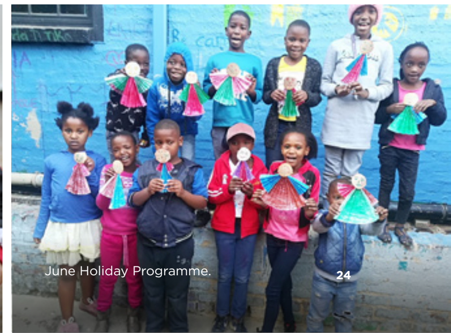
June Holiday Programme.