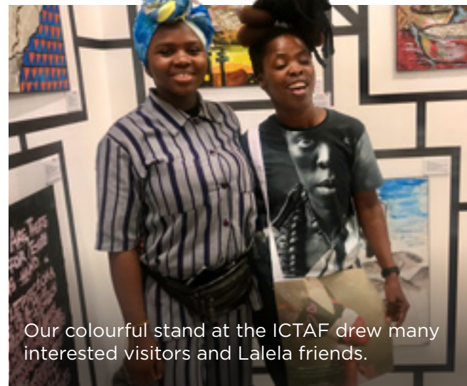
Our colourful stand at the ICTAF drew many interested visitors and Lalela friends.